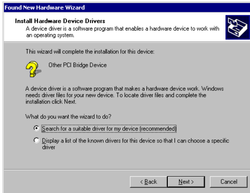
Figure 3 – Install Hardware Device Drivers dialog