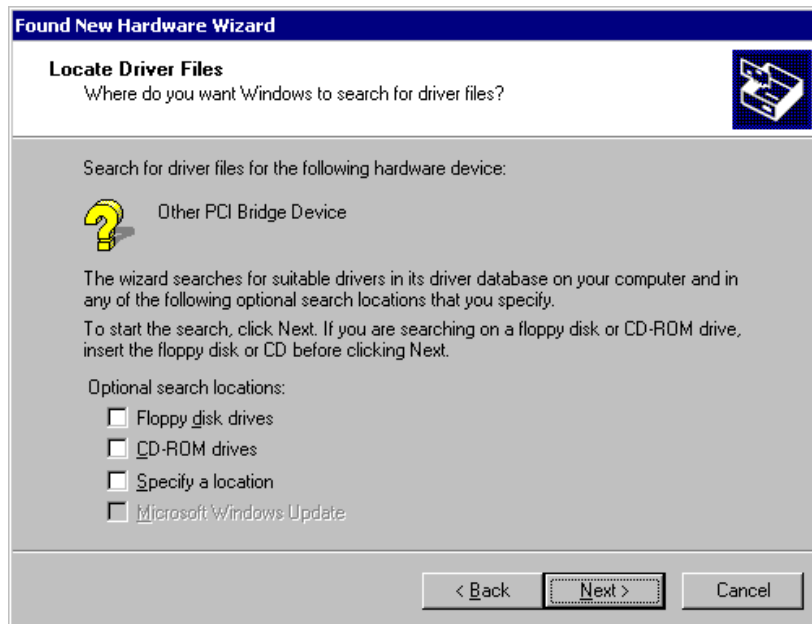
Figure 4 – Locate Driver Files dialog