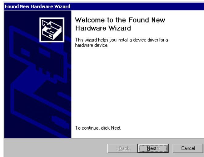
Figure 2 – Found New Hardware Wizard dialog