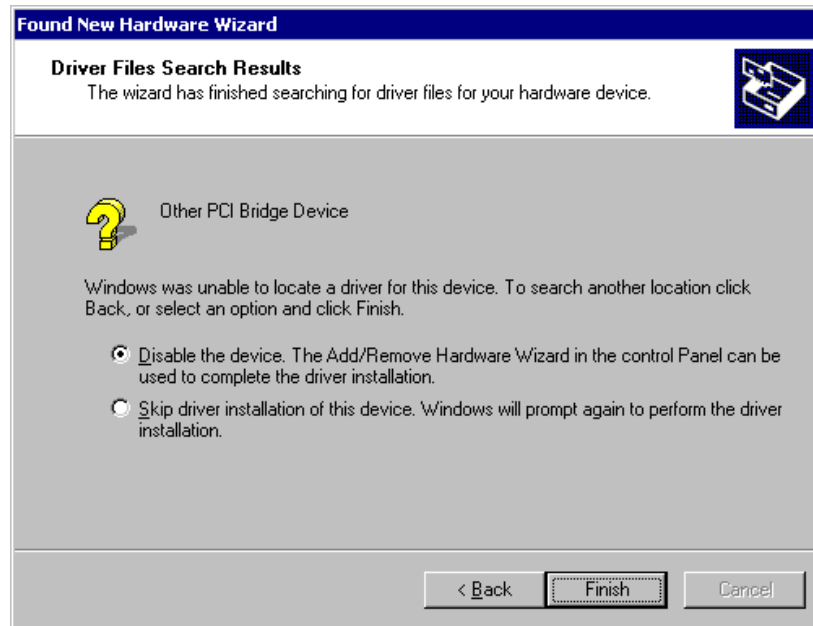
Figure 5 – MonteCarlo Uninstall icon